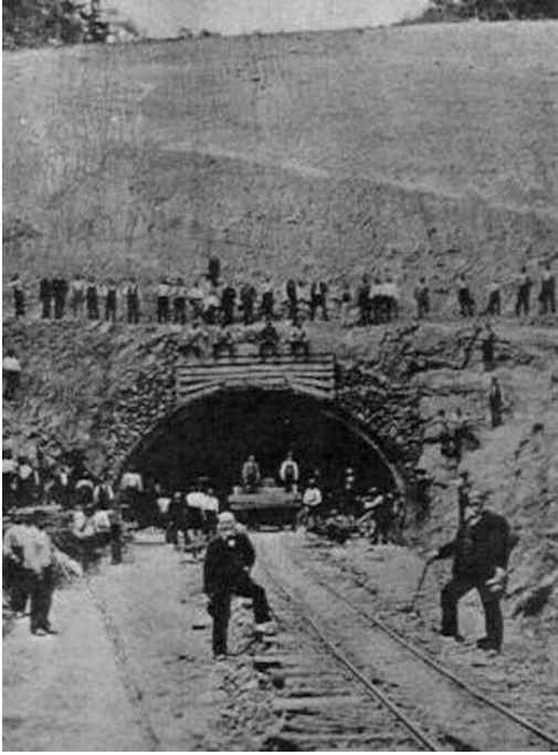
Andrew Carnegie Visits Rays Tunnel. This section of abandoned railroad is eventually used to make the Pennsylvania Turnpike!