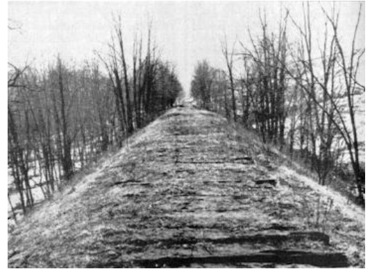
Grated Railbed Courtesy of the Pennsylvania State Archives

Courtesy of the Pennsylvania State Archives