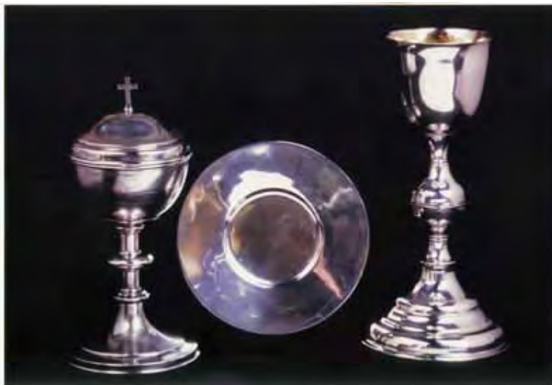
Gallitzin's chalice (stilled used today): Courtesy of the Prince Gallitzin Chapel House, Tomb Site and St. Michael's Basilica