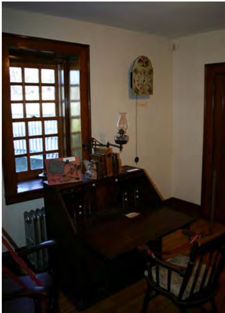
Picture of Gallitzin's desk and chair.