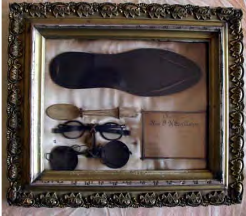
A sole from Father Gallitzin's shoe, a horn spoon, his spectacles, and a set of scales.