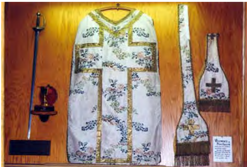
His vestment and sword. (His vestment was made from his mother's wedding gown.)