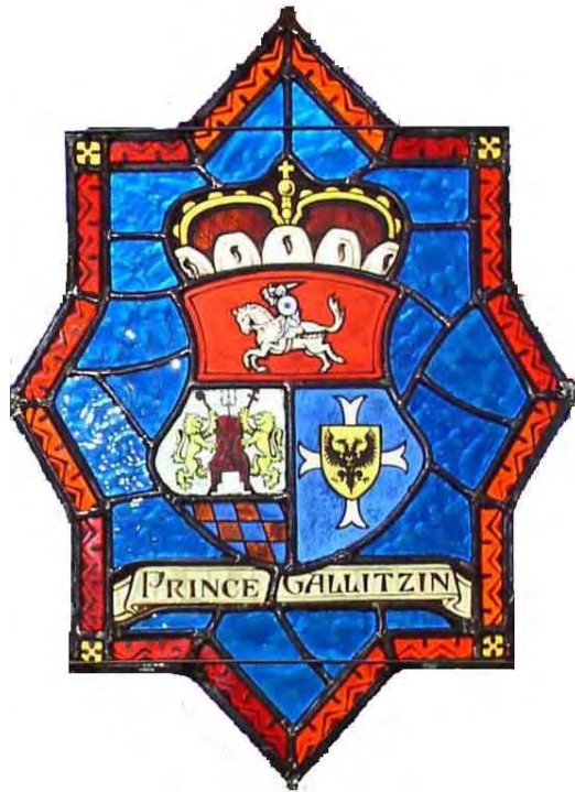
Stained glass window of the Gallitzin Family Coat of Arms.