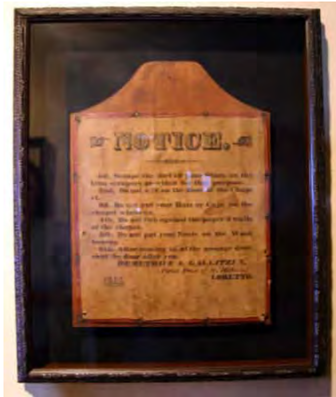
Sign of Gallitzin's rules of chapel behavior: Courtesy of the Prince Gallitzin Chapel House, Tomb Site and St. Michael's Basilica.