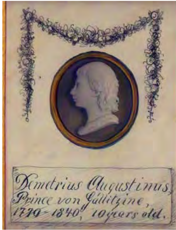
Cameo of Galitzin when he was ten years old