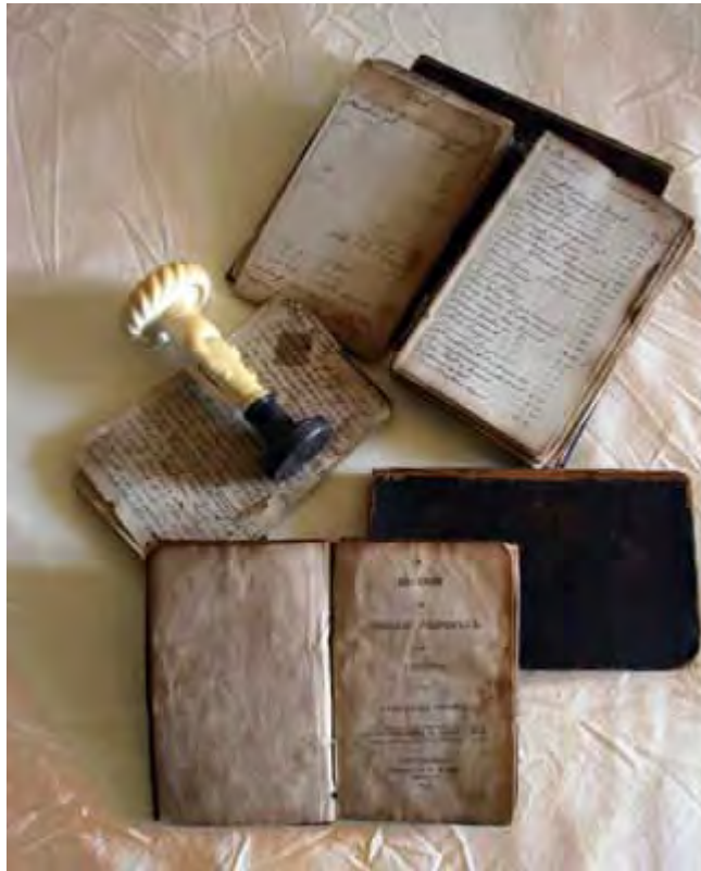
Memorandum book, Defence of Catholic Principles Book, diary, and seal