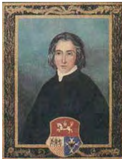
Portrait of a young man, Prince Gallitzin with the family coat of arms, 1799.