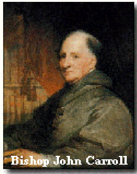
Bishop John Carroll who led a 22-year-old Prince Gallitzin into the Priesthood in Baltimore, Maryland. No credit information given.